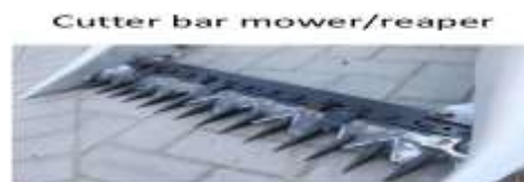
Fig. 3: Reciprocating blades

The term is commonly applied to a type of saw used in construction and demolition work. This type of saw, also known as a hognose has a large blade resembling that of a jigsaw and a handle oriented to allow the saw to be used comfortably on vertical surfaces. The typical design of this saw has a foot at the base of the blade, similar to that of a jigsaw. The user holds or rests this foot on the surface being cut so that the tendency of the blade to push away from or pull towards the cut as the blade travels through its movement can be countered.