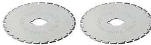
Fig. 2: Rotary blade cutters

Today there are many companies making rotary cutters. Cutters come in a variety of handle types and some include specialty blades to cut curved or zigzagged lines. Most have retractable blades that can be locked to prevent injury.