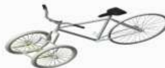
Fig. 1: Design model