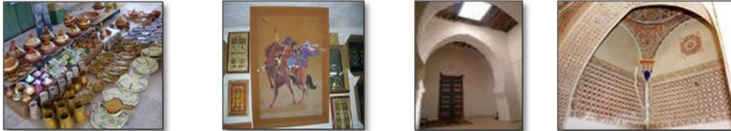
Fig. 5: craft samples in Kenadsa