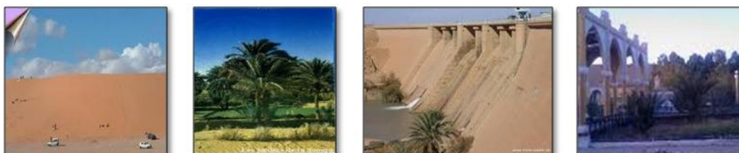
Fig. 4: some tourist places in Kenadsa

The development of town of Kenadsa at the level of touristic attraction, becomes a sine qua non, for a better appreciation of the picturesque landscape surrounding the city, and those intrinsic to the vernacular heritage, articulated with shifts in time to the industrial landscape.