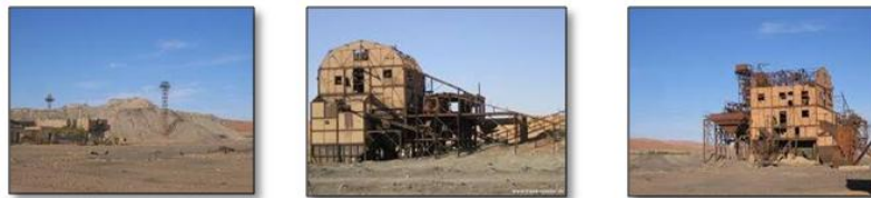
Fig. 3: scars of the industrialist landscape.

The man tends to appropriate the places conferred on him by the nature by inserting its traces in the landscape which he modifies constantly by inserting his traces in the landscape. This is explained as follows: « The product of experimental knowledge is in the same way, the product of our performances and our action. The landscape is always the product of work, economy, there is no land that the human being has not at least partially explored or changed. » (Santi, 2003). Only once these transmutations were less noticeable, because they were less drastic. But today, the landscapes are clearly marked by human activity. This is the case in Kenadsa, where the form of ownership of the environment as a result of mining, had serious consequences on the city. Landscape radically shaped the scars in this space revealing signs, and disclosing the footprints of economic activity which the spirit rememorates due to vacant and abandoned industrial sites but staked by some Brownfields.