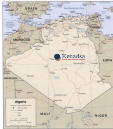
Fig. 1: map showing the situation of the city of kenadsa.

At the gates of the Algerian Sahara, the city of Kenadsa, piggyback on the ramification of the ksour along the Saoura Wadi.