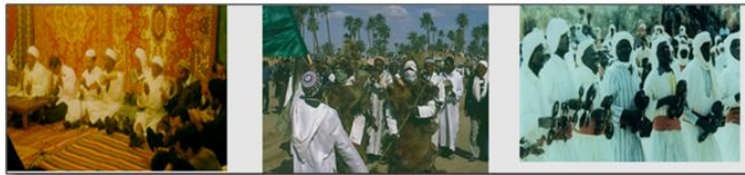
Fig. 6: types of cultural events in Kenadsa

If the party represents a fleeting moment in the history of urban transformation, the regular festivals show a lot of success in the social landscape. As elsewhere in the world, this cultural event testified with success of social and educational projects, a kind of cultural regeneration that promotes urban and environmental regeneration.