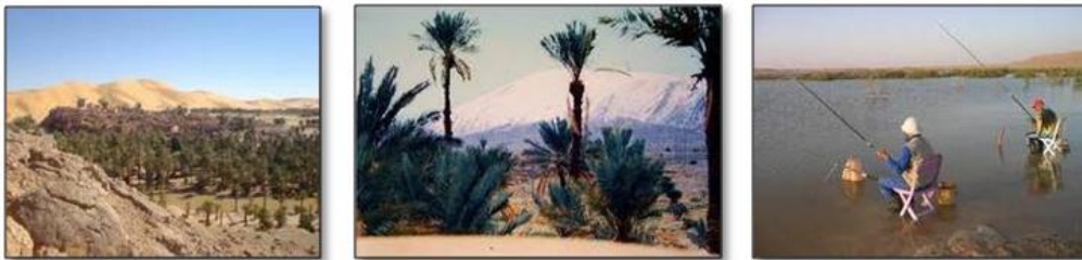
Fig. 2: natural landscape of Kenadsa. Source Author

On the one hand, the ksourians acted at the extreme of their knowledge, and their means on a virtually blank space, to meet their needs. Their implementation has been formally dictated by the natural landscape in-situ: the Barga (Mountain double side), the Palm Grove, and the Wadi. In this landscape, the life of the ksourians were organized ensuring social cohesion and a friendly atmosphere.