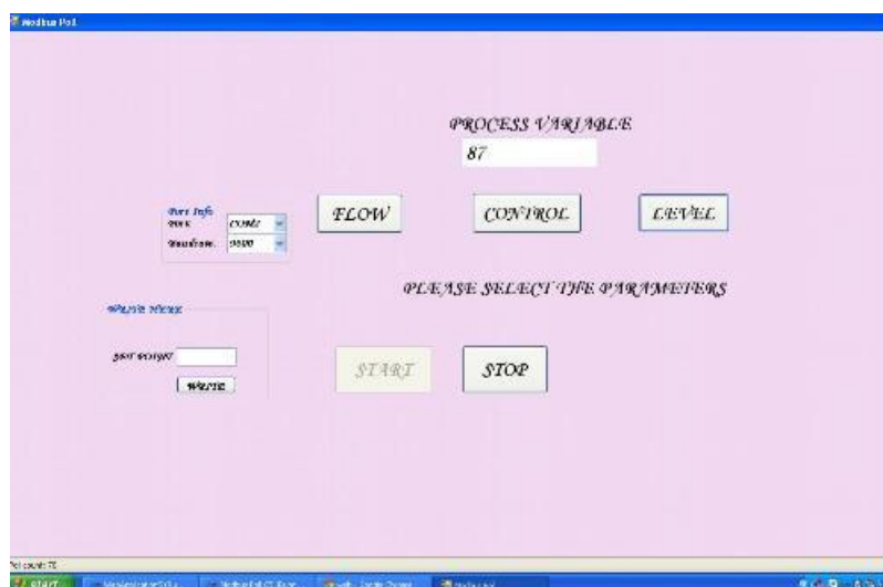
Fig. 4: Control page.

port number and bandwidth value should be given to the user before enables the process. As shown in the Fig.4, the flow, control, level buttons are used for monitoring the values and the write button is used for controlling the process.