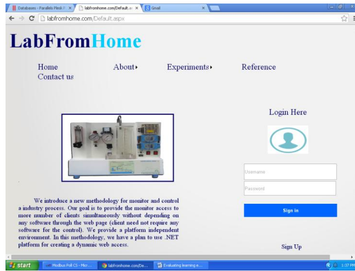
Fig. 3: Home page.

services. The result shows that this system supports various Web Browsers, such as Mozilla Firefox, Internet Explorer, Google Chrome, Opera, Safari, etc. Hence a common software solution for all kind of industry process is achieved. The high level security is obtained by authentication process for accessing the services. The new login process, control process are performed successfully and the obtained results are compared with PLC SCADA based automation system. The user can access the services by using the login option as shown in the Fig.3.